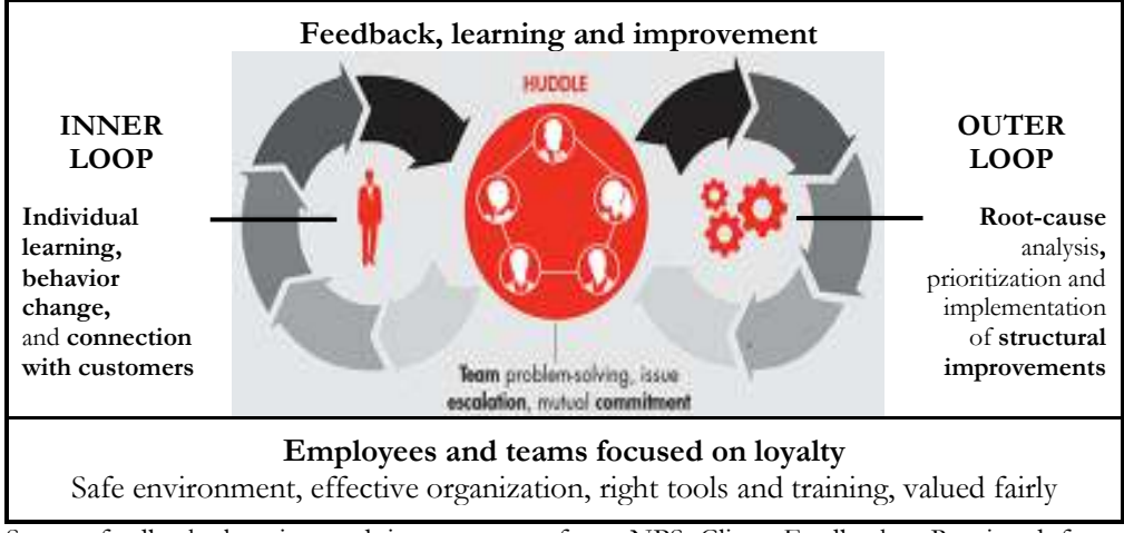
Figure 2 Net Promoter System Framework